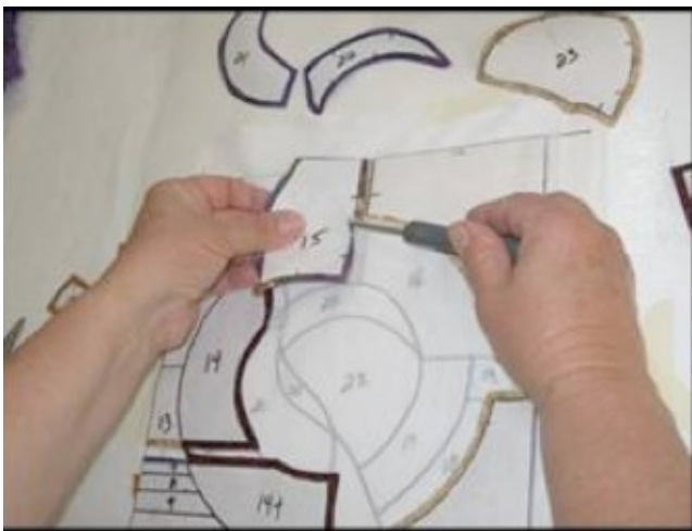
Building the quilt top.

Pictures detailing the French Fuse Appliqué technique are given below.